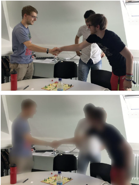
Sidebar 1: Original photo of three participants (top) vs. obfuscated version (bottom) where bodies are blurred (gaussian blur, radius = 40 px). We found that obfuscated lifelogs allow viewers to remember more details but with less accuracy.

“ Environmental lifelogging ” in this context is the recording of the environment using infrastructure cameras in the space capturing third-person views of the participants. For further examples, refer to [5].